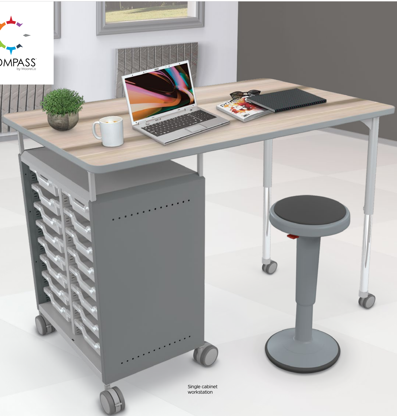
Single cabinet workstation

Empowering teachers to think, create, and do!