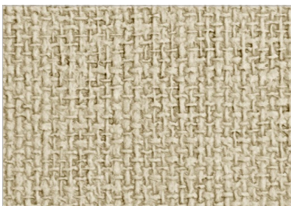
Rockport Replacing Champagne and Cotton

When current stock of colors above are depleted, new colors will be made available and substituted in for any older colors ordered.