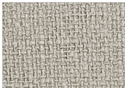
Silver Fox Replacing Gray and Platinum