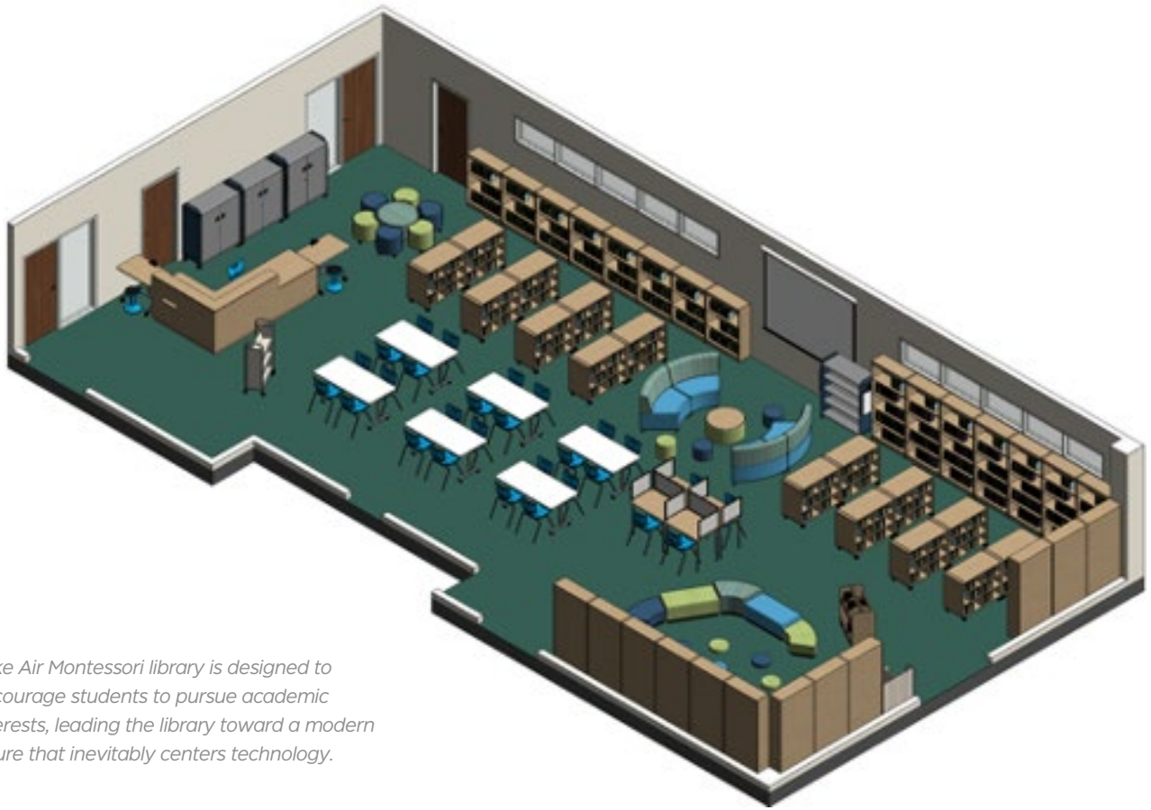
Lake Air Montessori library is designed to encourage students to pursue academic interests, leading the library toward a modern future that inevitably centers technology.