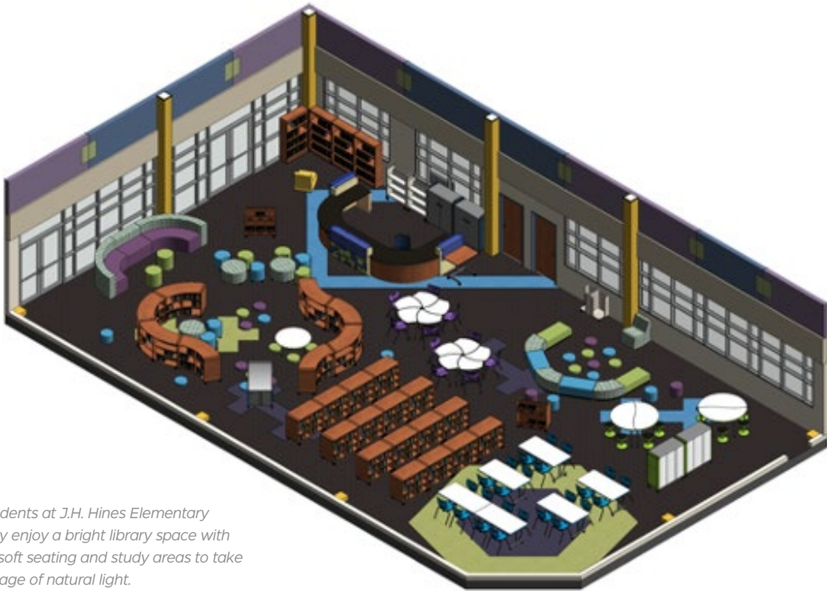
The students at J.H. Hines Elementary can fully enjoy a bright library space with ample soft seating and study areas to take advantage of natural light.