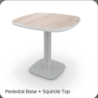
Pedestal Base + Squircle Top